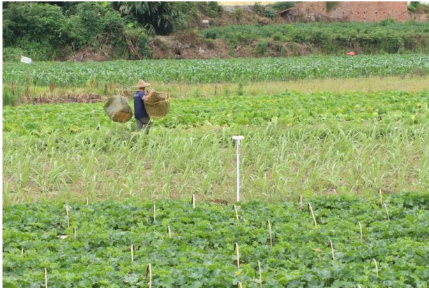
Farmland in China characterized by greater crop diversity, featuring a variety of crop types in smaller fields.

One of the main drivers of declines in biodiversity is increased farming to raise food production, so boosting the diversity of wildlife on farmlands is key in helping the environment.